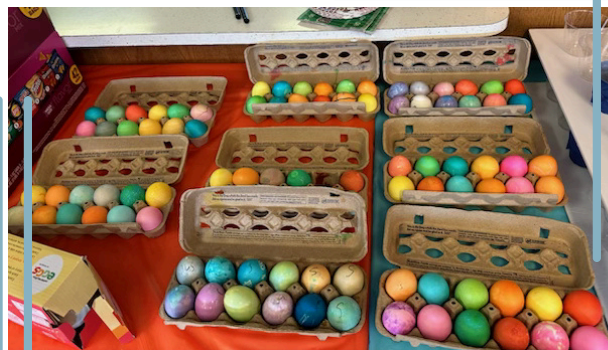
FIRST PRESBYTERIAN CHURCH, KENOVA, MEETS THE SATURDAY BEFORE EASTER TO COLOR EGGS FOR THE EASTER EGG HUNT FOLLOWING EASTER SERVICE.

With the egg hunt held at the church, the children hear a brief devotion during Children’s Church prior to the egg hunt. While the hunt is for the children attending church on Easter Sunday, everyone is welcome to participate. First Presbyterian likes to incorporate the Resurrection Eggs in children’s classes to include the youth in telling the story of Easter.