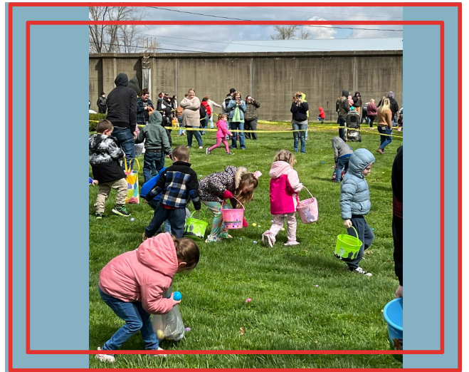
EACH YEAR, POINT PLEASANT PRESBYTERIAN PARTNERS WITH THE CITY AS THE LEAD SPONSOR FOR THEIR EASTER EGG HUNT.

Another way Point Pleasant Presbyterian comes together with the community is through a Lenten Lunch and Worship series which began in 1990. This luncheon series is sponsored by the Mason County Ministerial Association and hosted by Trinity United Methodist Church, but a dozen churches all across Mason County are involved. Weekly, this group sees 70-90 attendees. Pastors from the county alternate by preaching a short homily on a theme of their choice.