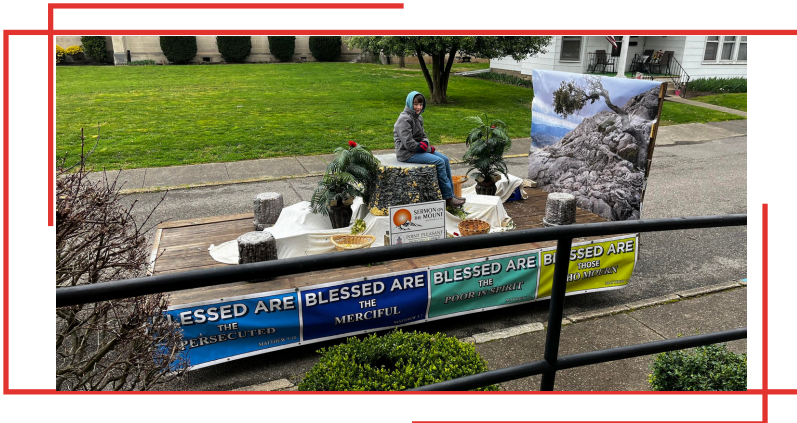
POINT PLEASANT PRESBYTERIAN CHURCH PARTICIPATES IN THE TOWN'S EASTER PARADE WITH THE SERMON ON THE MOUNT FLOAT EACH YEAR.

Point Pleasant Presbyterian Church enjoys sharing the love of God with the community. Always involved in numerous ministries, members of the congregation are particularly busy during the Lenten Season. From the community Easter Egg Hunt and Parade to weekly luncheons with worship, and a cantata, it is undeniable that Point Pleasant Presbyterian enjoys spending time with their brothers and sisters in Christ.